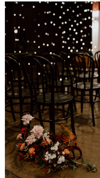
4. AISLE DECOR OR FLORAL