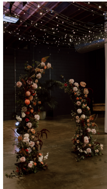
2. FLORAL TO COMPLETE ARBOUR