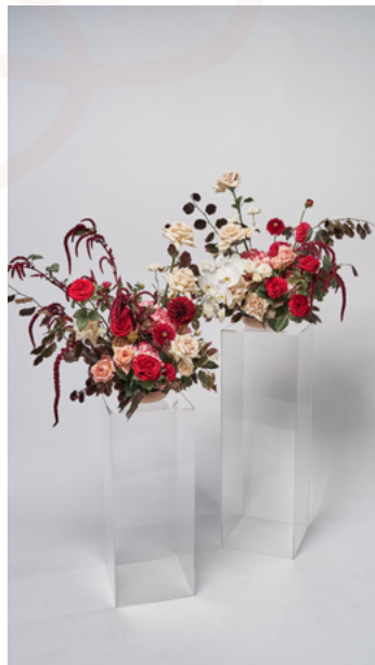
1. ARBOUR OR STRUCTURE

*Please note, this is only available with conjunction with a reception styling package.