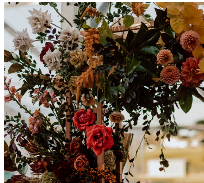
FULL ARBOUR FLORAL