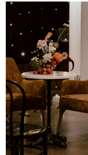
SIGNING TABLE FLORAL