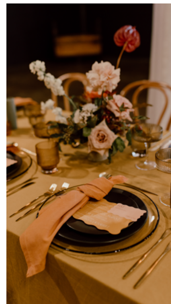
SIX PIECE CUTLERY SET