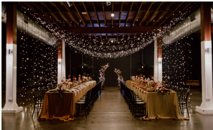
FAIRY LIT CEILING

However here is a snap shot for a guideline of ideas for your wedding ceremony & / or reception. Please note; all pricing is subject to availability and is subject to change.