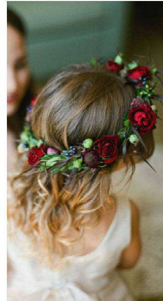
FLOWER GIRL CROWN