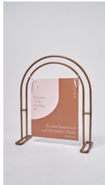
3. WELCOME SIGNAGE + HOLDER