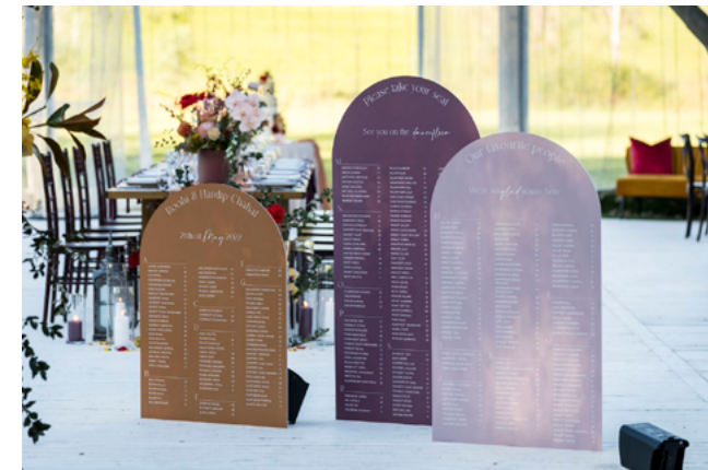
SIGNAGE + STATIONARY

A statement hanging installation with florals to create a wow factor can be offered. Pricing varies pending size & style of florals. Featured image quoted inclusive of pendant lighting.