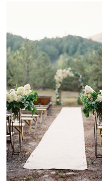
5. AISLE RUNNER

Items shown can be tailored to suit your vision and style