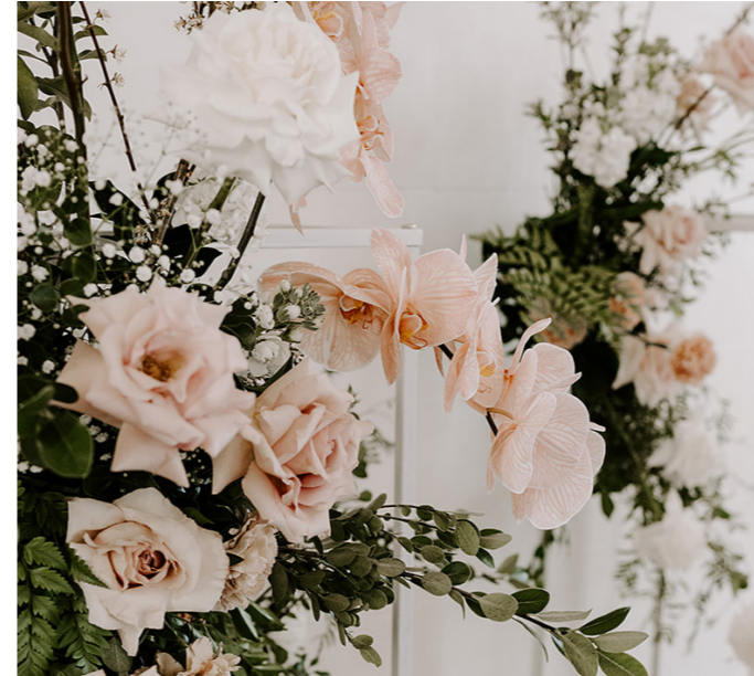
FULL ARBOUR FLORAL