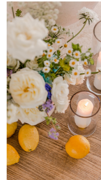
4. AISLE DECOR OR FLORAL