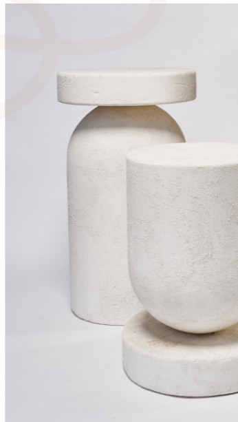
1. ARBOUR OR STRUCTURE

Items shown can be tailored to suit your vision and style