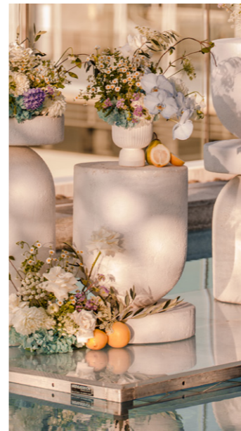
2. FLORAL TO COMPLETE ARBOUR