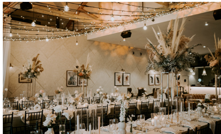
FAIRY LIT CEILING

However here is a snap shot for a guideline of ideas for your wedding ceremony & / or reception. Please note; all pricing is subject to availability and is subject to change.