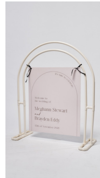
3. WELCOME SIGNAGE + HOLDER