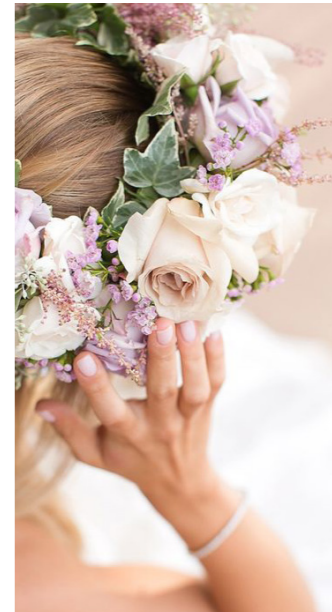
FLOWER GIRL CROWN