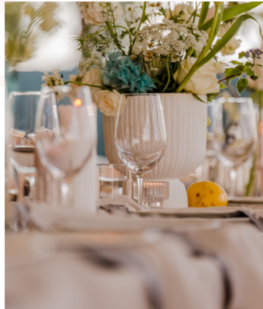
CUSTOM GLASSWEAR SUITE

Upgrade & enhance your package with any selection of stock items that we can use to personalise your look and vision. From customised signage & stationery, photo backdrop moments, bespoke candle colours & textures, to more flowers [always], we can upgrade your sit down reception styling to suit you specifically