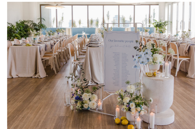
SIGNAGE + STATIONARY

A statement hanging installation with florals to create a wow factor can be offered. Pricing varies pending size & style of florals. Featured image quoted inclusive of pendant lighting.